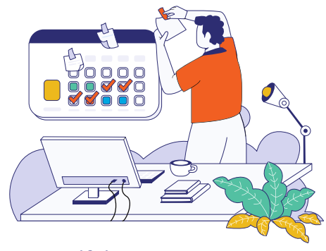
Unifying all leave types, policies, billing, and fulfillment

With our absence management platform enhancement, you can combine proven insurer efficiency technology with solutions that give your clients a best-in-class experience with capabilities like: