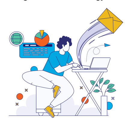
Automating paperwork requests and reminders

EIS brings insurer technology that makes processing and paying claims easier and more efficient by: