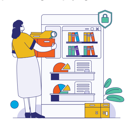
Consolidating all paperwork into one e-folder